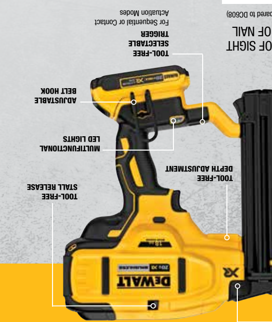
Diagram illustrating the features of the DeWalt 20V MAX XR Belt Hook: ADJUSTABLE BELT HOOK MULTIFUNCTIONAL LED LIGHTS TOOL-FREE STALL RELEASE TOOL-FREE DEPTH ADJUSTMENT TOOL-FREE JAM RELEASE