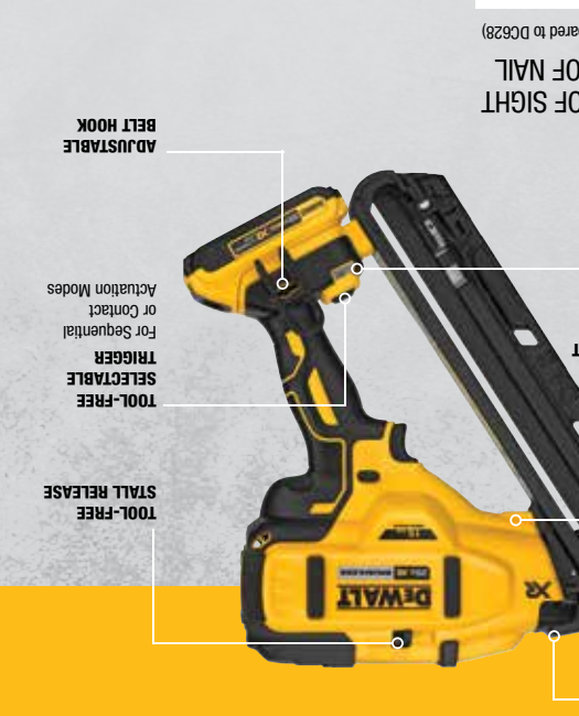
Diagram illustrating the features of the DeWalt XR Multi-Tool: TOOL-FREE JAM RELEASE : Located at the bottom of the tool. TOOL-FREE DEPTH ADJUSTMENT : Located on the side of the tool. MULTIFUNCTIONAL LED LIGHTS : Located at the top of the tool. TOOL-FREE SELECTABLE TRIGGER : Located on the handle, for Sequential or Contact Activation Modes. TOOL-FREE STALL RELEASE : Located on the handle.

Diagram illustrating the features of the DeWalt 20V MAX XR Hammer Drill: LED LIGHTS MULTIFUNCTIONAL TOOL-FREE STALL RELEASE DEPTH ADJUSTMENT TOOL-FREE BOTTOM LOAD MAGAZINE MAXIMUM TORQUE